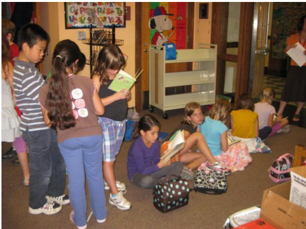
Students enjoy their first check out of the year!

By the end of the 1 st week of school, everyone had a chance to check out their first books!